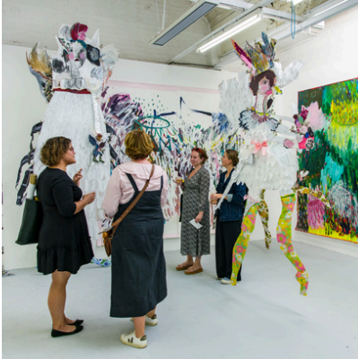
MA Show 2022