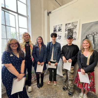
Foundation Show Prize Winners 2023