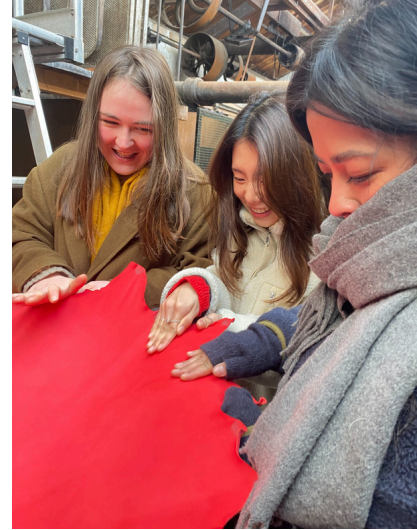
BA (Hons) Conservation: Books & Paper students learning about leather conservation a day trip to Northamptonshire