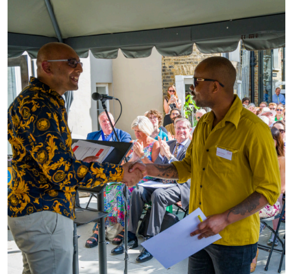
Degree Show Ceremony 2023