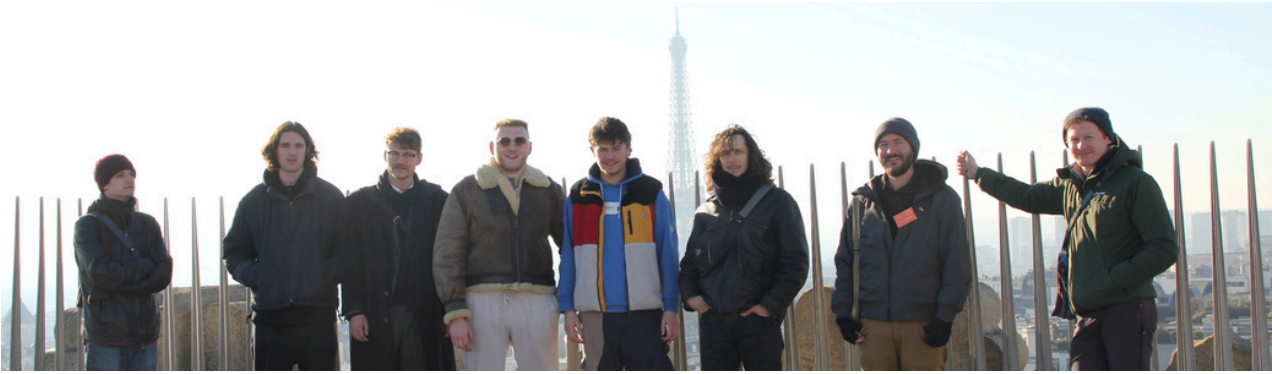
BA (Hons) Carving students on the annual Paris Study Trip

Over thirty BA Carving and BA Conservation Students went to Paris in February for the annual first year Study Trip. From behind-the-scenes studio visits to seeing Versailles, libraries and cathedrals, our students were able to see a huge amount across the 5-day trip, which was generously subsidised by the Stuart Heath Charitable Settlement.